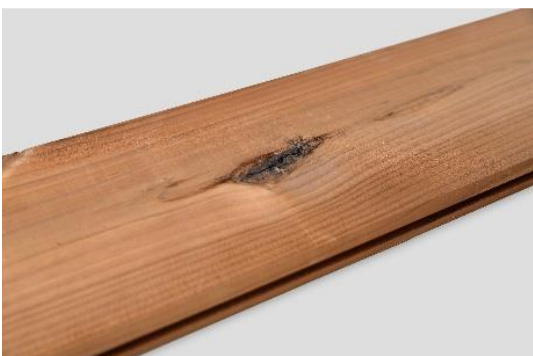
Individual small scars and pockets are allowed.