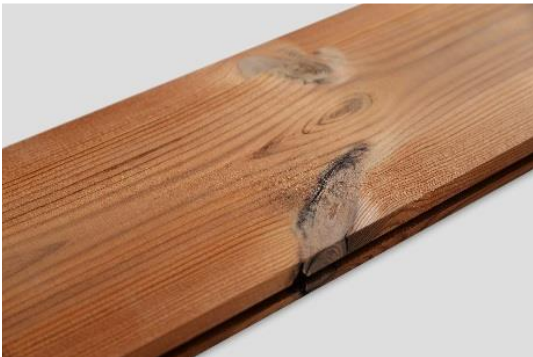
Individual bark knots are allowed.