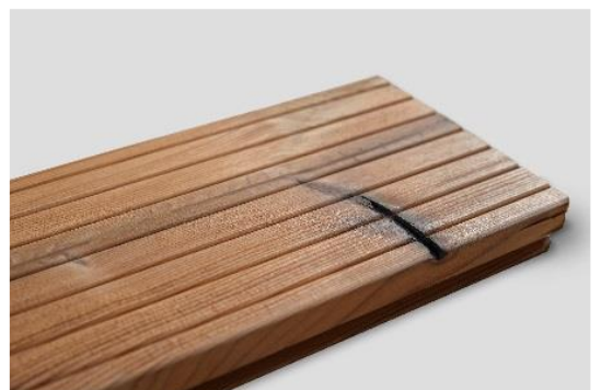
Small loose-knots are allowed.