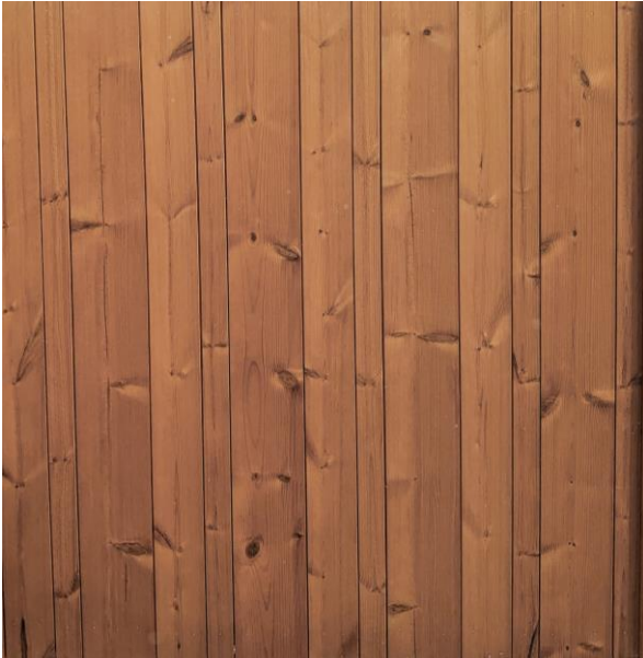
Pine facade, A-grade