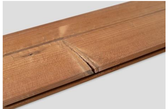
Individual splits of (live) knots are allowed. In spruce, the cross checks of the knots belong to the general appearance.