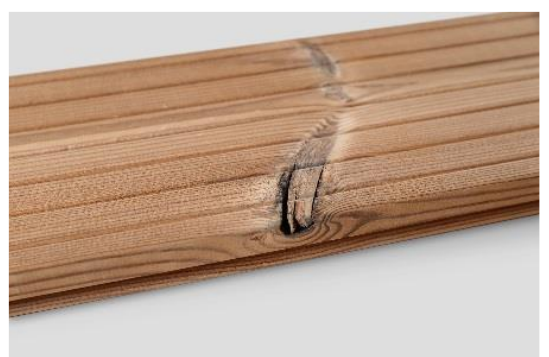
Small dry (loose) knots on the edge of the board are allowed.