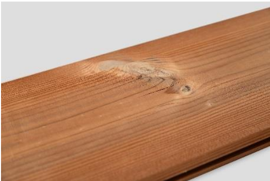
Small surface cracks are allowed.