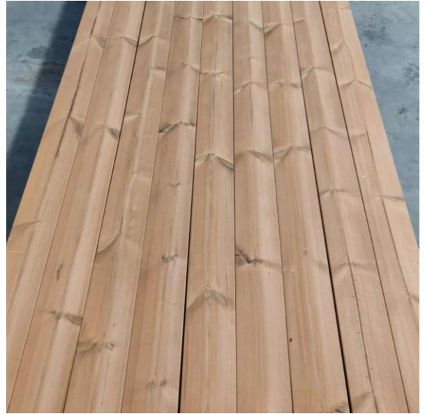
Pine decking, A-grade