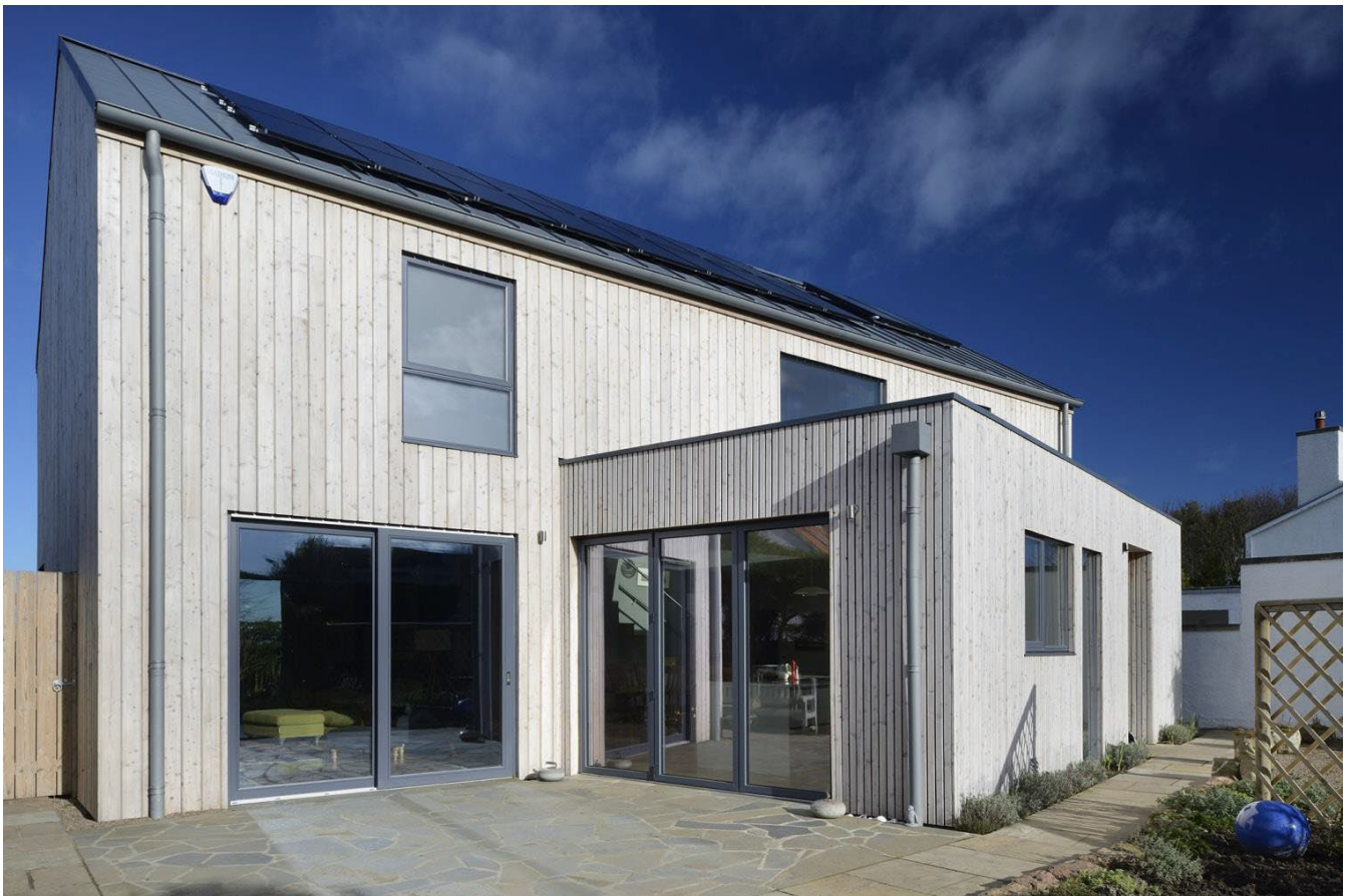
Scotlarch® with SiOO:X in East Lothian after one year's weathering.

SiOO:X is a wood modification system which to work effectively needs to penetrate the timber substrate as far as possible. After the treatment application, and, activated by moisture a curing reaction commences, which forms a flexible silica network. Over time, the mineral silicate cures by reacting with atmospheric carbon to precipitate an insoluble silica network within the wood structure. This curing process continues for around three years. The result is that the timber surface is toughened and an even accelerated weathering takes place which is a permanent change. The cure rate is temperature dependent and will proceed very slowly in cold exterior conditions. In some situations where the surface is not exposed to moisture, the silvery-grey surface appearance may not develop and this can be remedied by the application a water spray from time to time.